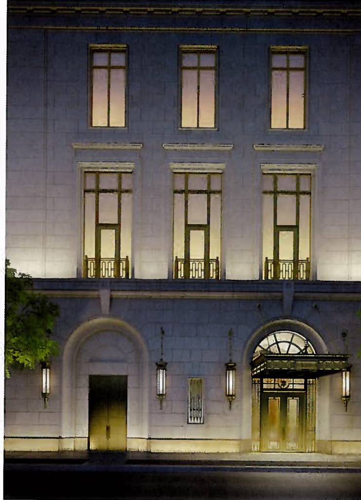
A New Classic: The limestone tower echoes the great historic architecture in a truly modern way.

520 Park Avenue is designed with a private club atmosphere in mind and will be complete with a lavish suite of amenities. The building uniquely has a private club of its own, inspired by the elegant Annabel's in London. Step through the mansion-inspired entrance into the lobby and you'll be transported to a restful haven in the midst of the city. With spectacular residences, 15,000 square feet of amenities and just 33 apartments, 520 Park Avenue is arguably the most exclusive building, in the undisputed best neighborhood in New York. ♦