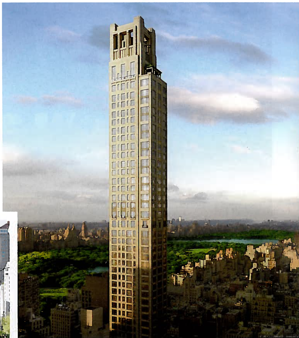
520 Park Avenue, the only new development on the Upper East Side west of Park Avenue, is poised to become the most exclusive building in the neighborhood.

One building in particular, soon to rise above this splendid enclave, will be 520 Park Avenue, a sophisticated tower clad in Indiana limestone that connects to the iconic fabric of the Upper East Side,