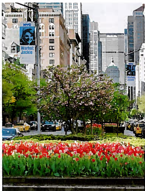
The splendor of Park Avenue in Bloom.

including the grand towers of the 1920s and '30s such as the Pierre, Sherry-Netherland, and the Carlyle. The fully residential tower—currently being built and slated for completion in 2018—will create a momentous silhouette that pays homage to the landmark architecture of decades past, but with modern amenities and thoughtful layouts for today's Upper East Side lifestyle.